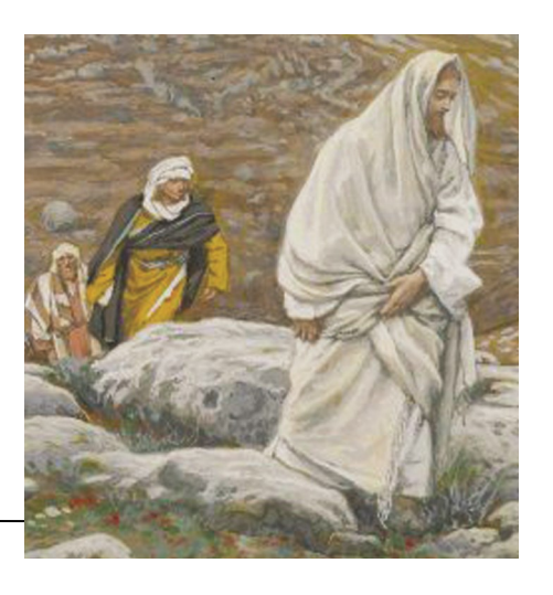
FAITH OF OUR FATHERS

Welcome to St. Nicholas! Please help us to preserve the sanctity of this time and space by maintaining a reverent silence before and after the liturgy.