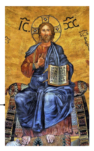
ALL HAIL THE POWER OF JESUS' NAME